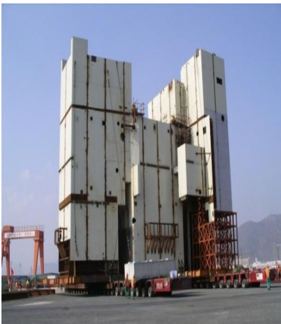
Figure 2 16

The enormity of the task of fabricating and delivering assembled modules stems from their size, weight and numbers. Divided into Mechanical and Structural (and sub-module) categories the AP1000 is made up of 160 Structural Modules and 56 Mechanical modules – many weighing several hundreds of tons or more when assembled.